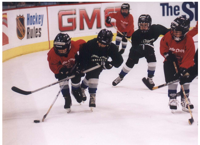
A pair of mites battled for the puck along the boards.

EVHA does not participate in the Apple Valley July 4 parade because players are not allowed to inline skate along the parade route.